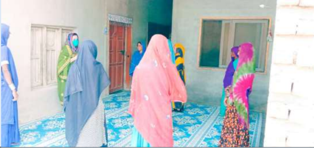
COVID-19 Community session at Distict Badin