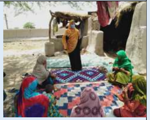
Covid-19 awareness session and hand washing activity at district Kashmore @ Knadhkot