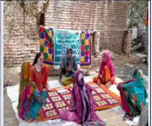
Community based COVID-19 Awareness sessions at District Jacobabad