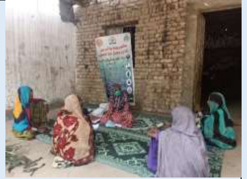
COVID-19 Awareness sessions were conducted in District Mirpurkhas