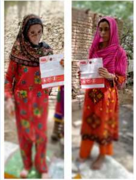
IEC Material dissemination-Jacobabd