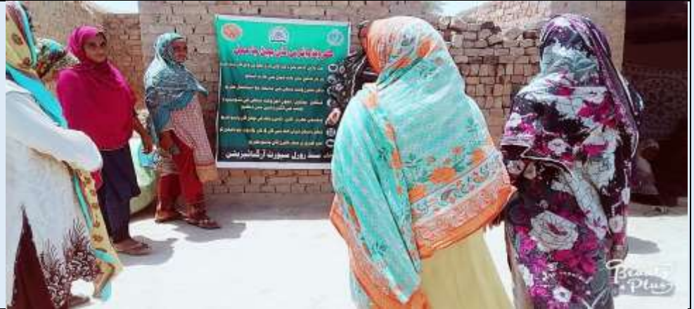
COVID-19 Awareness sessions at District Khairpur