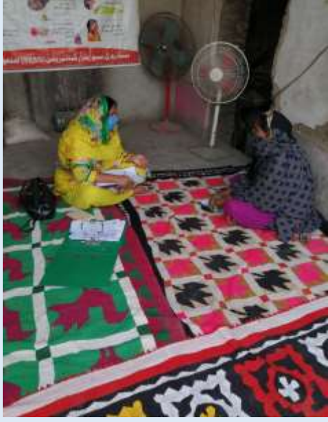
Community based COVID-19 Awareness sessions at Shikarpur The End